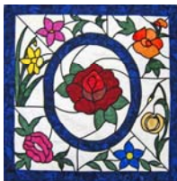
Boquet of Flowers