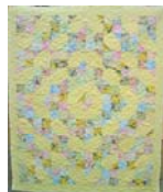
Fresh Tradition from the American Patchwork & Quilting Magazine. Features the Henry Glass Fabric “Fresh as a Daisy”. Quilt measures: 45½” x 55½” Five background color choices: Yellow, Pink, Blue, Green, & White

Star Crossed Table Runner is just the easy table runner pattern you’re looking for. Runner measures 21” x 49”. Kit Available in: