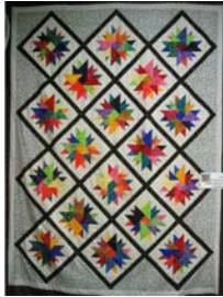
Diamonds in the Rough